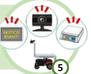
Peripheral power supply

Status output, input from wireless network/ PLC, etc.