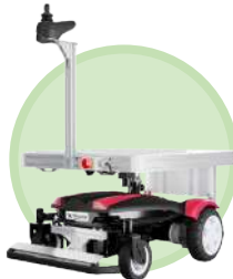
THOUZER STANDARD Standard choice by many