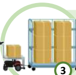
Towing jig customization

Expansion, wireless charging, fast charging