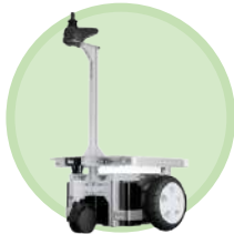
THOUZER MINI Nimble in narrow space