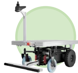
THOUZER GIANT Handle heavyweight