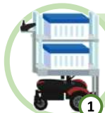
3D CAD files

Design based on 3D CAD file can be shared